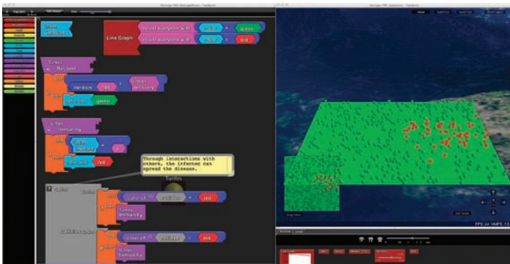
Figure 4: Inspecting the mechanism for infection in a basic contagion model in StarLogo TNG.

The first is the use of rich computational environments. Rich computational environments are ones in which the underlying abstractions and mechanisms can be inspected, manipulated and customized. For example, consider the differences between SimCity and a model in StarLogo TNG. In SimCity, a user may add buildings to a city and see correlations between adding buildings and CO 2 production but the underlying formulae and model are hidden from view. Contrast that with a StarLogo TNG environment in which the user can “look under the hood” and inspect the causal relationships and abstractions that are embedded in a model. The rich computational environment is one in which the user can develop CT skills and transform from user to creator. See Figure 4.