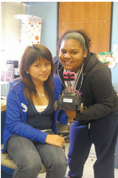
Figure 3: Two iCODE students display their Sumo robot.

A second domain that promotes computational thinking with pre-college students is robotics. In a robotics project, student programmers design and program robots and other physical devices with embedded code. They need to think about how the robotic agent will interact within its world, based on factors such as its sensor values and the effects of its actuators. As they do this, the student makes choices of how their programming will connect these processes together to achieve the desired results.