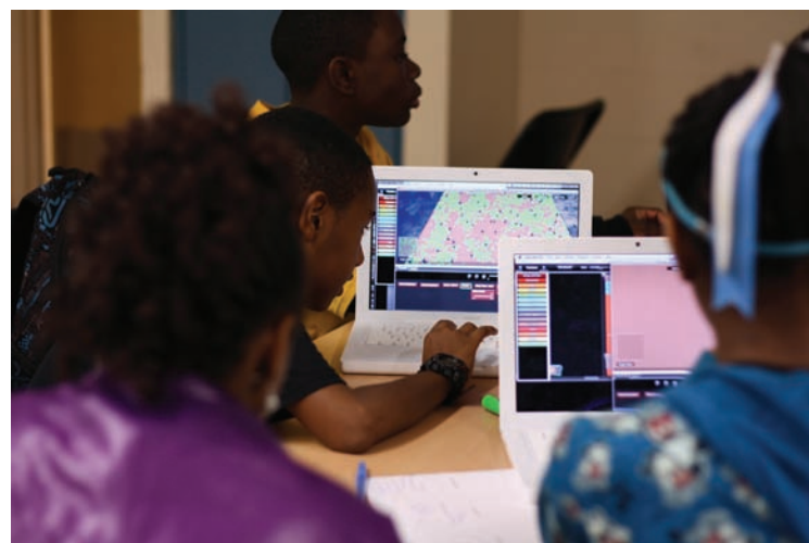
Figure 1: GUTS club members creating ecosystem models in Chicago.

the process of abstraction to narrow the problem down to something that could be implemented on the computer using StarLogo TNG, an agent based modeling tool. Restrictions imposed by the modeling environment include an upper bound on the number of agents (4076) and a limit on the size of the environment (101 by 101 cells). Within these parameters students designed and created models as testbeds to answer questions about real-world concerns. For example, as part of the Project GUTS unit on Epidemiology, a group of students wanted to know if a disease would spread throughout their school population given the layout of the school, the number of students, the movement of the students, the virulence of the disease, and the number of students initially infected. See Figure 1.